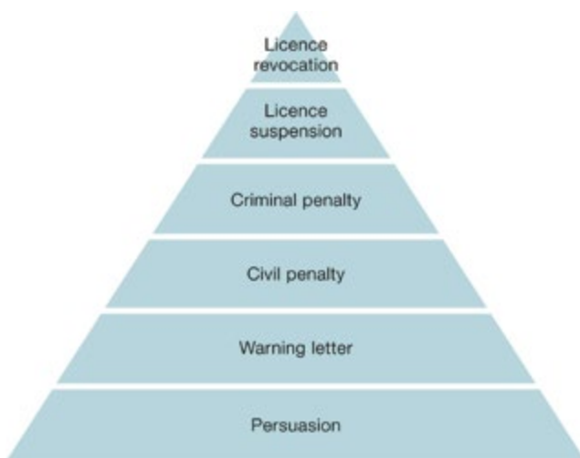
Figure 1: An example of a pyramid of sanctions for enforcement 12

Effective enforcement depends not only on the willingness of the regulated participants to comply, but also on the range of regulatory tools established by legislation. Strong rules without strong enforcement are a major threat to the