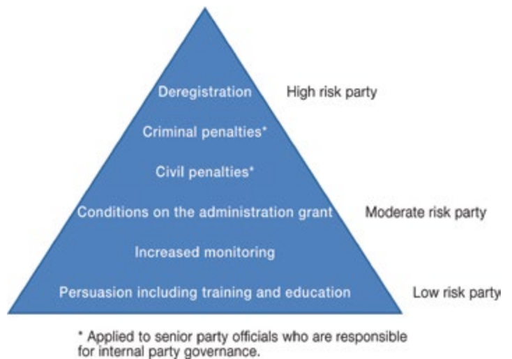
Figure 2: A risk-based enforcement pyramid of tiered strategies for party regulation

Parties with moderate internal capabilities receive greater scrutiny and regulatory intervention. Parties that are unwilling to comply with regulations and do not have the internal capabilities are rated as high risk and subjected to greater regulatory action, which may include moderate fines, civil and criminal punishment and partial or complete withdrawal of the Administration Fund. The severity of the fines and other sanctions applied naturally involves some discretion.